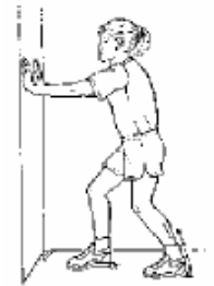
Heel Cord Stretch (Achilles Tendon)